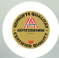
Austria seal of approval

The economic focus is on customer satisfaction and our social aim is geared toward employee motivation, healthcare and the protection of children.