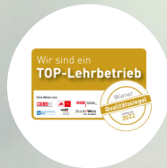
Top employer for young professionals